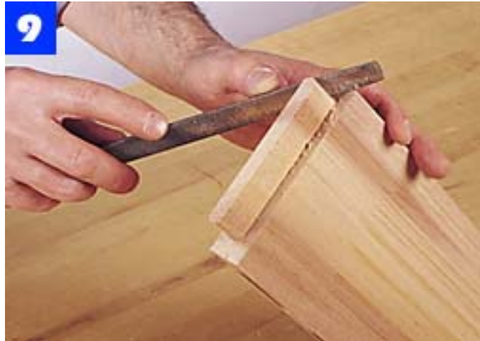
Round off a tenon with a rasp. The tenon's radius matches the radius left by the spiral up-cutting bit used to cut the mortise.

Lay out the mortise locations for the tabletop and benchtop joints. Use a router with an edge guide and a spiral up-cutting bit to cut the mortises ( Photo 10 ). It is best to clamp three workpieces of the same width together when routing to form a wide and stable base for the plunge router.