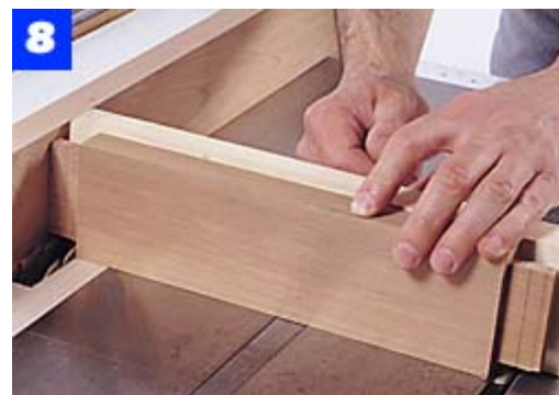
To cut the shoulders on a tenon, stand the apron up, and hold it firmly to the miter gauge. Butt it to the fence and make the cut.

Cut the tenons across the width of each workpiece, then adjust the blade height and move each workpiece over the blade on edge to cut the shoulder ( Photo 8 ). Clamp each workpiece upright in a vise and gently round over the tenon's edges using a wood rasp ( Photo 9 ).