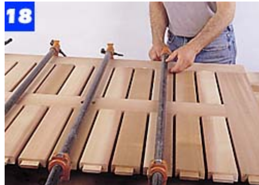
Clamp one stile at each end of the top subassembly. Space clamps evenly and at the center of a tenon.

Mark the benchtops and tabletop for the 45 degree corner cuts, and make these cuts with a sabre saw. Sand the cut corners smooth, then use the chamfer bit in the router to shape the table edges and benchtops. Use the router and chamfer bit to shape the top edge of the umbrella hole as well.