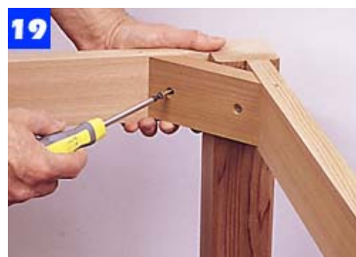
A corner block is installed at each leg on the table and the benches. A pair of screws holds each block to the aprons.

Rip, crosscut and miter the 1-in.-thick stock to make corner blocks. Bore and countersink pilot holes in each block, and then attach them with screws to the aprons for the table and benches ( Photo 19 ).