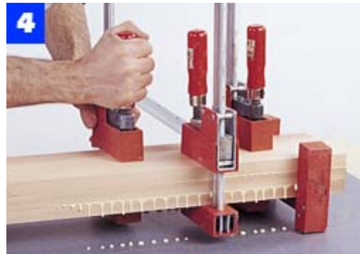
For the bench legs, spread glue on 3/4-in.-thick stock. Lay disposable material under the pieces and clamp them together.

Rip and crosscut material for the leg blanks slightly oversize, then use a foam roller to spread glue on the mating surfaces of each piece. Assemble the pieces into a stack, and clamp the pieces together ( Photo 4 ). After about 20 minutes, scrape off the glue that has squeezed from the joints, then allow the glue to fully set.