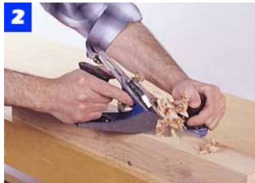
Clamp a table leg to a benchtop and remove saw marks with a hand plane. To make a smooth cut, push the plane at an angle.