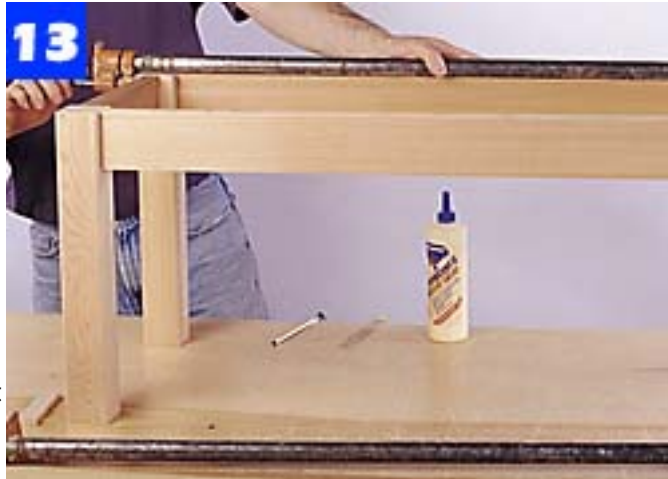
Join two leg-apron subassemblies spanned by a long pair of aprons. Glue and clamp this to complete a bench base.

Assemble the table base in the same manner as the bench bases. Make two subassemblies consisting of a pair of legs and one apron. When the glue has set on these, join the subassemblies spanned by a pair of aprons.