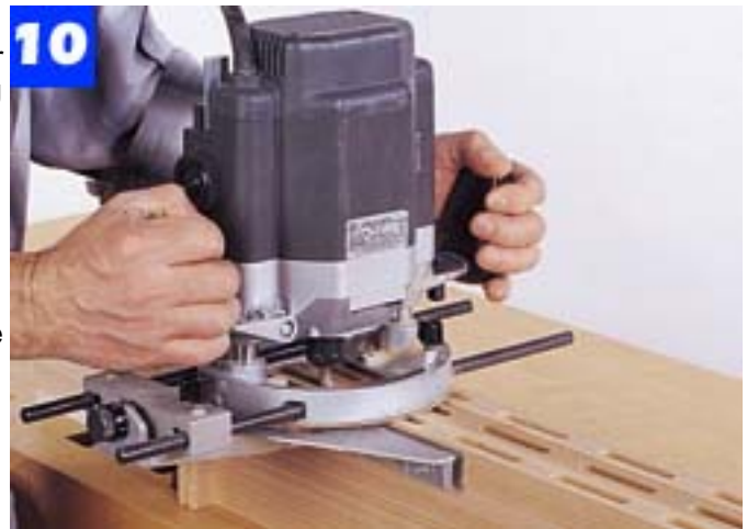
To cut the long row of mortises in each stile and rail, clamp three of the work-pieces together to support the router.

After laying out the locations of the holes in the aprons for mounting the top, use a Forstner bit in the drill press to counterbore a recess for each screwhead. Next, use a 3/16-in.-dia. bit to drill the pilot holes for the screw shanks. Each of these holes is centered in a recess.