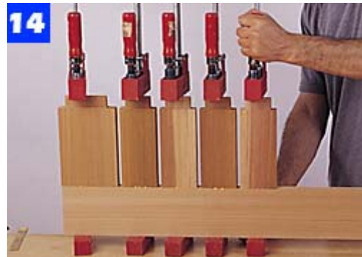
The first stage in assembling a benchtop is to glue and clamp slats to one stile. Use one clamp in the center of each slat.

Now move on to assembling the benchtops. Since there are several slats in each top, assemble each top in stages. First, glue and clamp the slats to one long rail ( Photo 14 ). After the glue sets on those joints, apply the opposite rail.