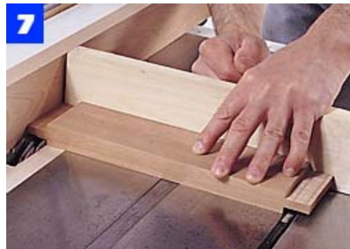
Use a dado blade setup in the table saw to cut the tenons on the apron pieces. Butt each apron to the fence, and make the cut.

Rip and crosscut 1-in.-thick stock for the table and bench aprons as well as for the top frames and slats. Install dado blades in the table saw, and then use the miter gauge to guide the workpiece over the saw blades when cutting tenons ( Photo 7 ). Note that you can use the rip fence as a stop to gauge the tenon length. Since the tenons are 1 in. long, you need to make two passes to complete each cheek.