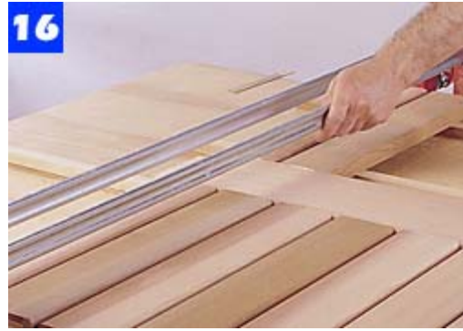
A second set of slats is glued and clamped to the center rail. Again, use one clamp in the center of each slat.

Approach the tabletop assembly in the same manner. Begin by gluing and clamping a slat at each end of the center rail. Fill in between these two slats with more slats ( Photo 15 ). When the glue is dry on this subassembly, glue and clamp slats to the opposite side ( Photo 16 ). Next, glue and clamp the side rails to this subassembly ( Photo 17 ). When the glue is set on that subassembly, position clamps across it and then glue and clamp one stile to it ( Photo 18 ). Complete the top by gluing and clamping the second stile.