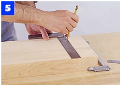
Rip and crosscut the individual bench legs to size, and then clamp them together. Mark out mortise locations on the legs.

Lay out the mortise locations in all the legs for the apron joints. You can speed the process by clamping four legs together with their ends perfectly aligned. Then, mark across the stack using a square ( Photo 5 ). Next, use the router and edge guide to cut the leg mortises ( Photo 6 ). It's best to use a spiral up-cutting bit in the router because that type of bit pulls the dust and chips out of the cut, and reduces the strain on the motor. This also keeps the bit's cutting edge cooler.