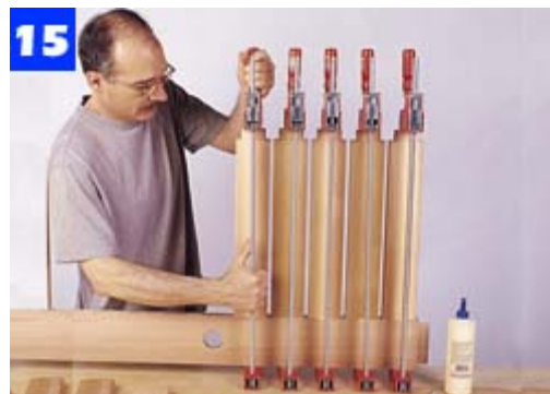
Multiple subassemblies are made in assembling the tabletop. First, slats are joined to the center rail.