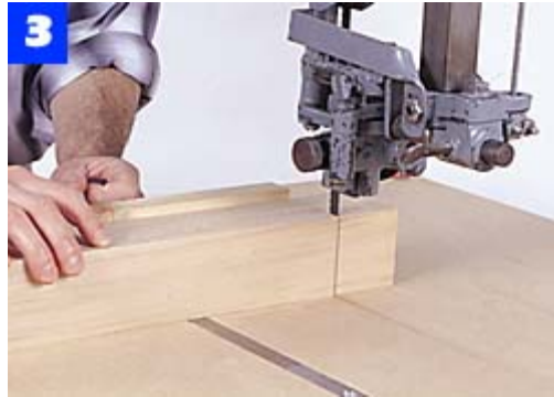
Crosscut the legs on the band saw. Here, a shopmade crosscutting table and a miter gauge are used to make the cut.

Since the bench legs are smaller than the table legs, it is a better use of materials to glue them up from three pieces of 3/4-in.-thick stock. You can simplify the job if you plan to make the blanks large enough to cut four legs from each glued-up stack.