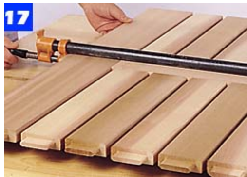
Glue and clamp a side rail to the center rail. One clamp, carefully centered, should provide enough force.

Using this technique, you will not have to worry about getting all the parts together before the glue begins to set. Your results will be better, and the stress of a frantic assembly is eliminated.