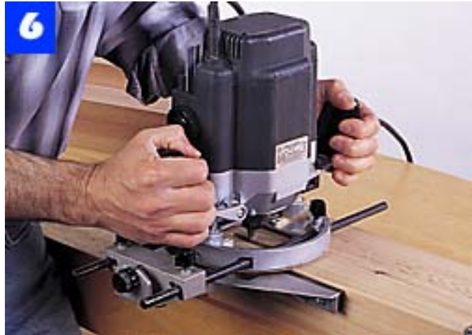
Using a spiral up-cutting bit in a plunge router, cut the table leg mortises. Two legs clamped together provide a stable base.

Rip and crosscut 1-in.-thick stock for the table and bench aprons as well as for the top frames and slats. Install dado blades in the table saw, and then use the miter gauge to guide the workpiece over the saw blades when cutting tenons ( Photo 7 ). Note that you can use the rip fence as a stop to gauge the tenon length. Since the tenons are 1 in. long, you need to make two passes to complete each cheek.