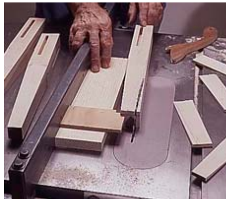
5--Use a stepped jig on the table saw to cut the leg tapers. Each step positions the leg to cut two tapers.

Smooth the inner leg surfaces using a sander, but sand the mortised faces gently by hand to avoid distorting the surface surrounding the mortise. The mortise surface has to remain flat and square.