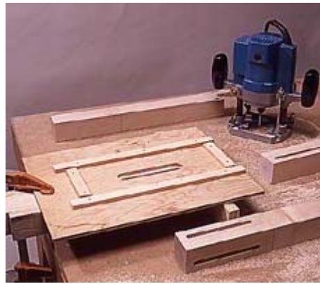
4--Use a jig and a plunge router to cut the leg mortises. The stops are positioned to suit the router's base.