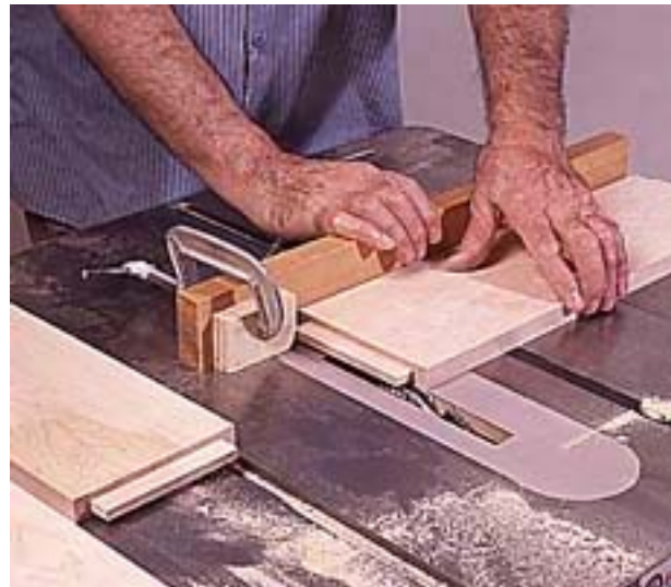
7--Use a stopblock clamped to the miter gauge and a dado blade in the table saw to cut the apron tenons.

We finished the table with three coats of polyurethane lightly tinted with a few drops of yellow ochre to give it a warm honey color.